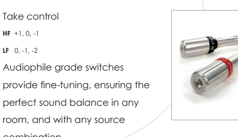
With absolute transparency of audio in mind the fact Ag pure silver coated binding post is the solution