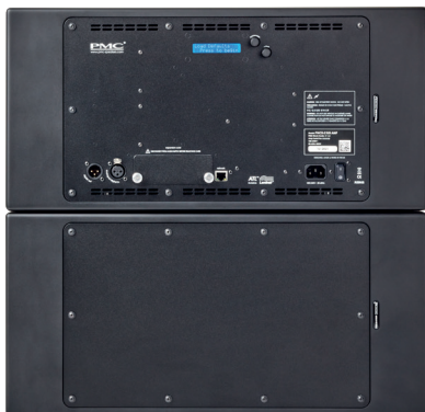
PMC8-2 SUB rear panel