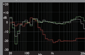
Green - driver output, on axis Grey - off axis Red - port output