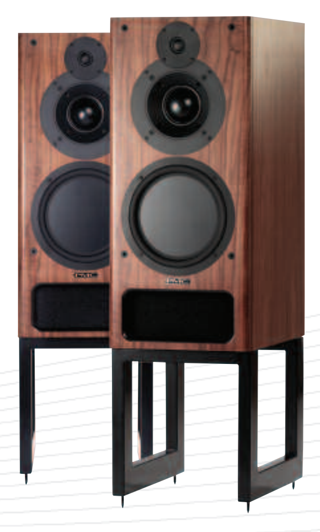
IB2i - Walnut