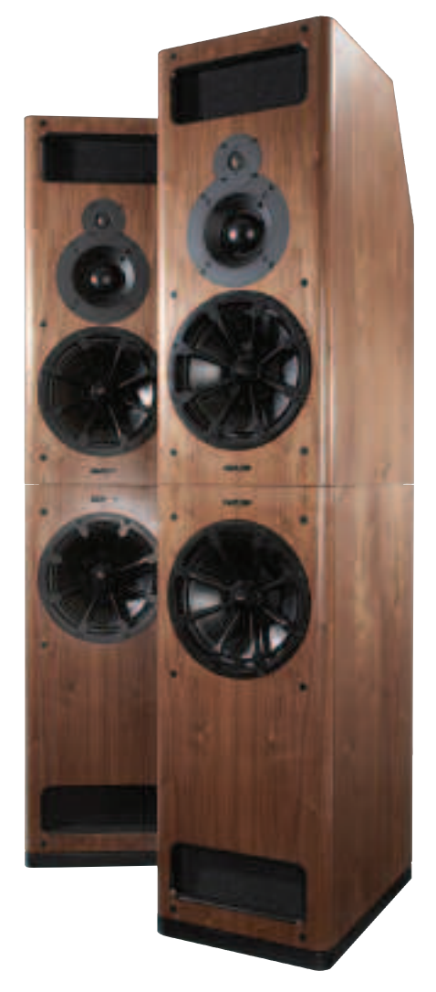
MB2XBD# - Walnut

The MB2XBD** is a floorstanding, ATL ** passive monitor and is an interesting alternative to the BB5i. It shares the same characteristic delivery of vast scale and astonishing detail at all listening levels but in a slimmer flexible twin cabinet design.